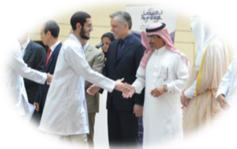
Alfaisal University Students Honored at Annual Student Research Recognition Day