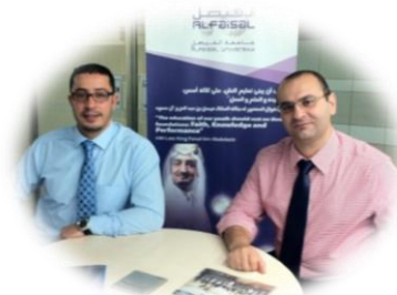
Two Sponsored Research Projects Totalling Almost 2 Million SAR Awarded to Faculty Members in College of Science & General Studies and College of Engineering