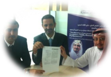
First US Patent Assigned to Alfaisal University Chemistry Professor & his Research Team in Applied Nanotechnology