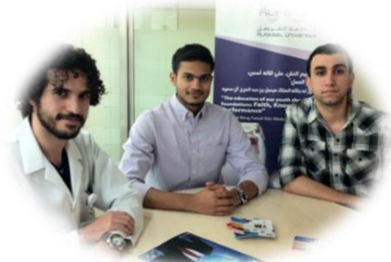
Five Alfaisal University Student Projects Awarded $50,000 USD in BOEING Students Research Grants